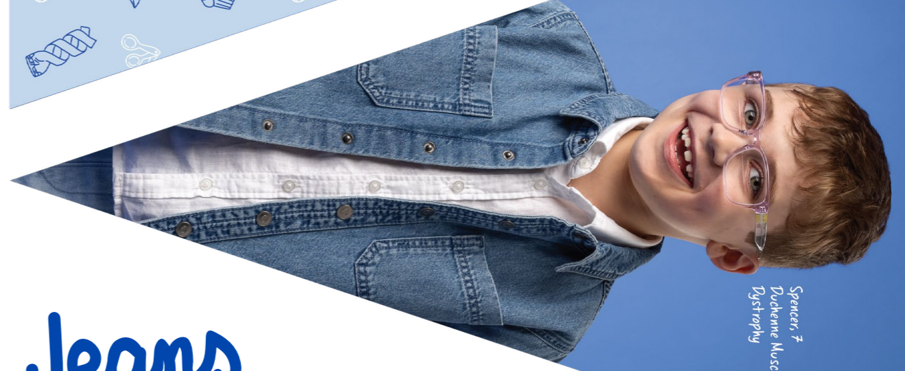
Spencer, 7 Duchenne Muscular Dystrophy