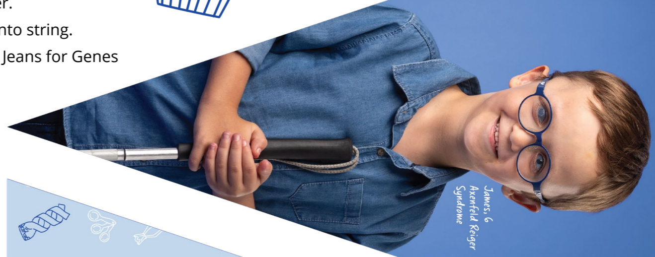
James, 6 Axenfeld-Rieger Syndrome