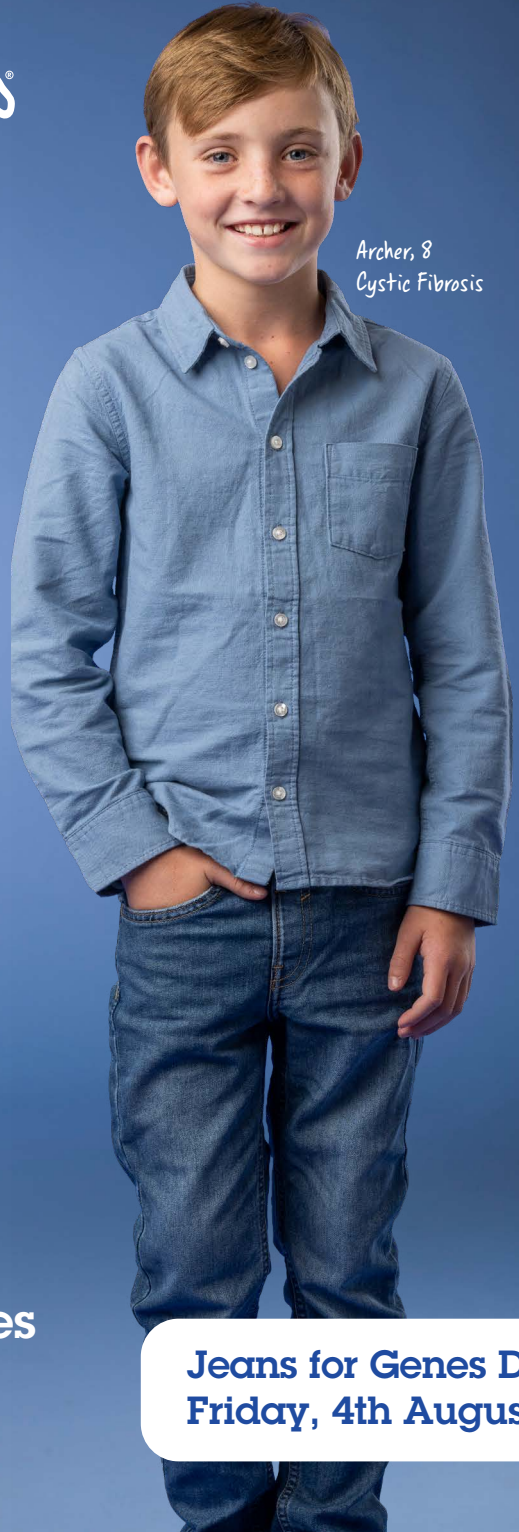
Archer, 8 Cystic Fibrosis