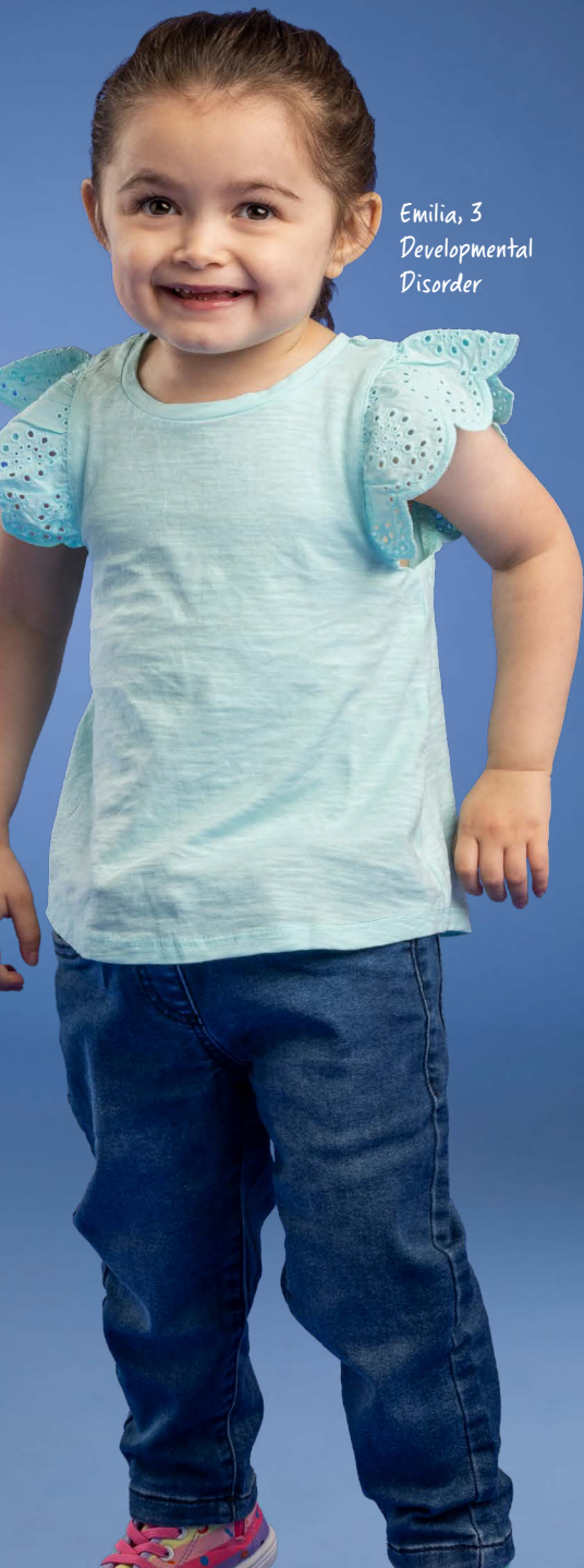
Emilia, 3 Developmental Disorder