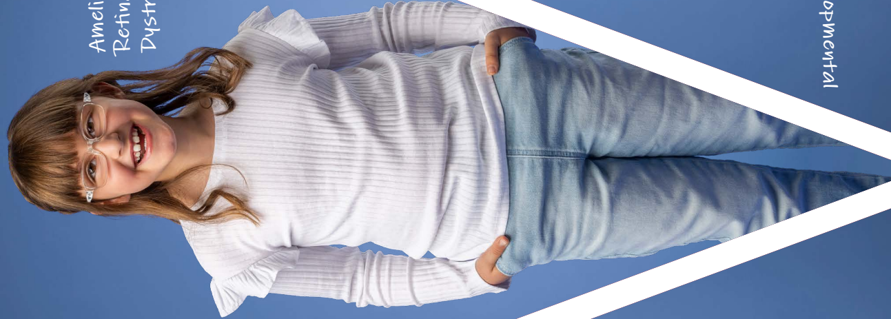
Amelia, 7 Retinal Dystrophy