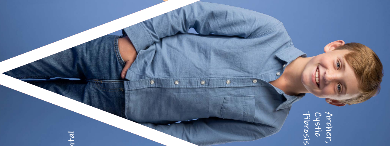
Archer, 8 Cystic Fibrosis