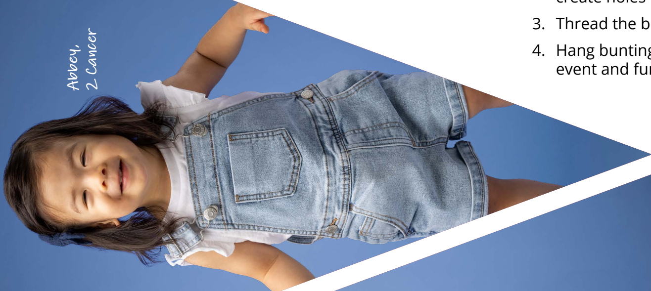
Abbey, 2 Cancer