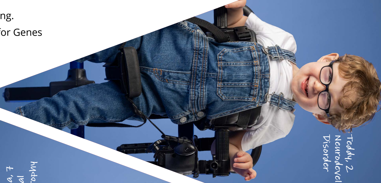
Teddy, 2 Neurodevelopmental Disorder