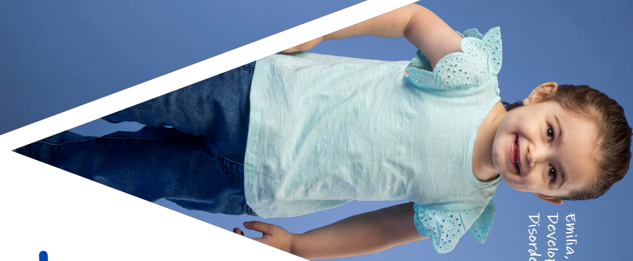
Emily, 3 Developmental Disorder