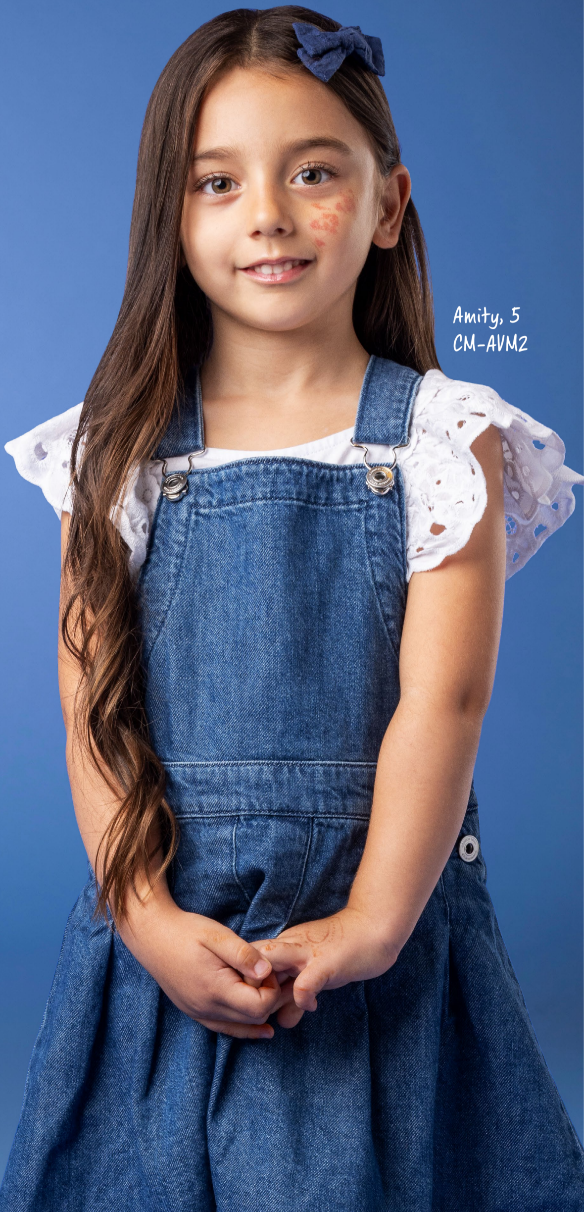
Amity, 5 CM-AVM2