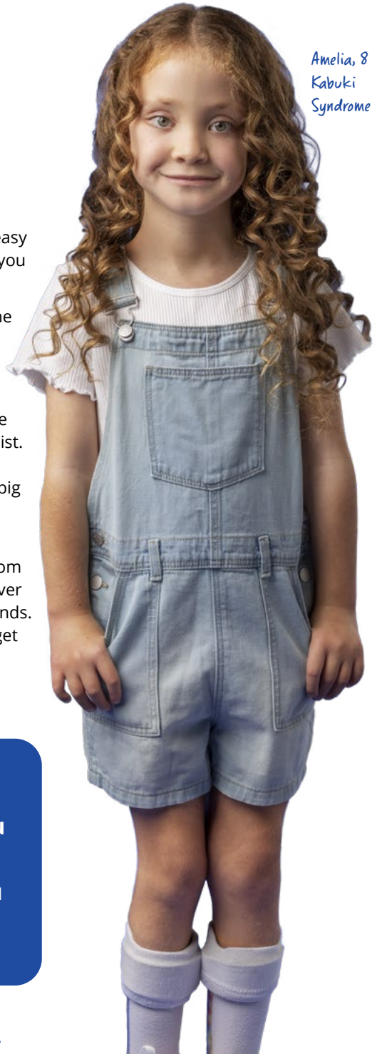
Amelia, 8 Kabuki Syndrome