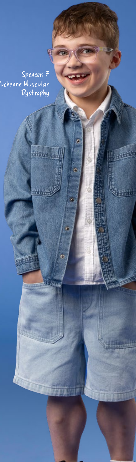
Spencer, 7 Duchenne Muscular Dystrophy