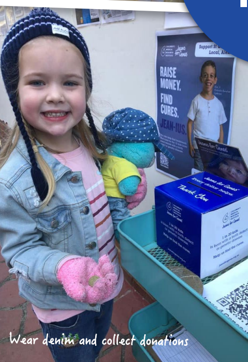
Wear denim and collect donations