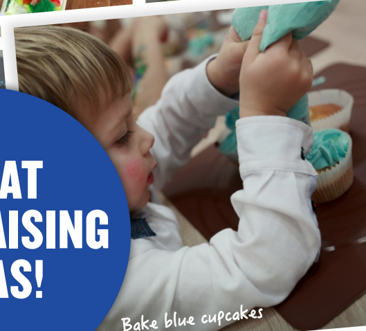
Bake blue cupcakes