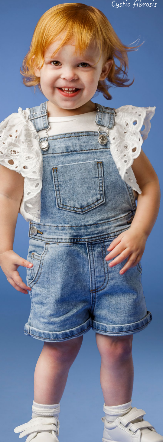
Emilia, 2 Cystic fibrosis