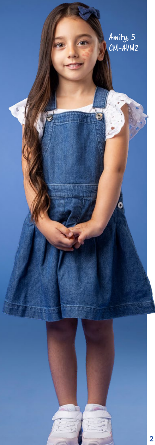
Amity, 5 CM-AVM2